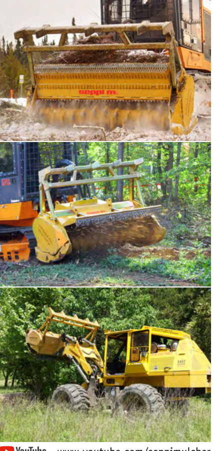
▶ YouTube www.youtube.com/seppimulcher